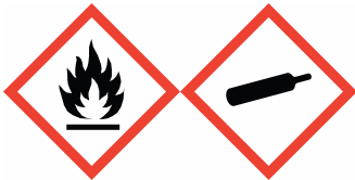
Flammable Compressed Gas

Gasses under pressure - Compressed gas Flammable Aerosols - Category 1