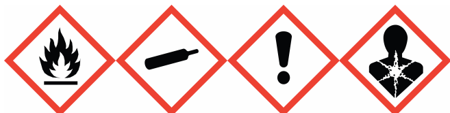
Flammable Compressed Gas Irritant Health Hazard

Aspiration Hazard - Category 1 Toxic to Reproduction - Category 2 Skin Irritation - Category 2 Eye Irritation - Category 2 Specific Target Organ Toxicity (repeated exposure) - Category 2 Specific Target Organ Toxicity (single exposure) - Category 3 Flammable Aerosols - Category 1 Gasses under pressure - Compressed gas