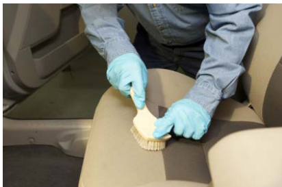
STEP 4 Agitate the product directionally (not in circles) over the entire seat panel with a soft-bristled upholstery brush. This ensures that the "lay" of the fabric's nap is uniform.