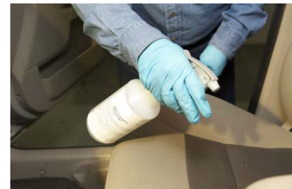
STEP 3 Lightly mist Fabric Cleaner & Protectant on the entire seat panel (not just the soiled section of the seat), and allow to dwell 3 – 5 minutes. Do not over-saturate the fabric