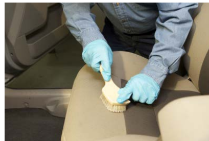
STEP 2 Dry brush the entire seat panel in one direction (not in circles) with a soft bristled upholstery brush.