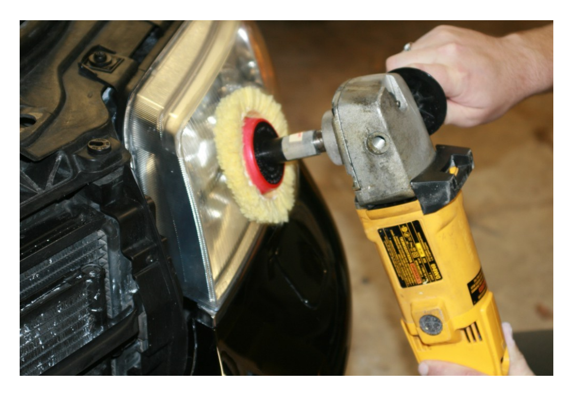
Pic D: Polishing the Lens

4. Using the wool pad, begin by applying a quarter-sized amount of polish to the CENTER of the buffer pad. Put the pad on the lens and turn on the polisher feathering the trigger so that nothing splatters. With the speed set at 1200RPM, begin working an area 6 inches by 6 inches. Once that area begins to clear up, move over 4 inches and buff another area. After polishing the lens, remove the tape and use the miracle cloth to wipe down the lens and surrounding bodywork to remove excess polish, pad hair, and drip lines from the wet sanding. Finish by applying a light coat of wax to the lens for added protection. You are now halfway done! Now repeat these steps again on the other side!