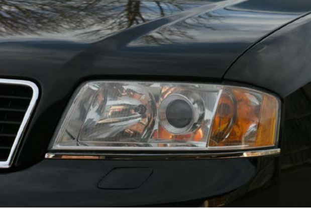
Pic E: Before & After