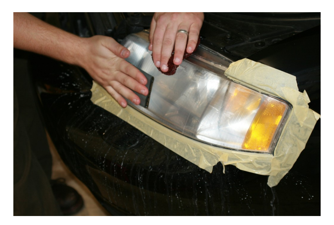
Pic B: Wet Sanding

3. Begin by assessing the lens. If the lens is not discolored but cloudy, go to step 4 and polish the lens. If the lens is yellow, begin by wet sanding the lens with sand paper until you remove the entire UV coating from the lens. This coating oxidizes with exposure to the elements and will begin to cloud and yellow. The purpose of this sanding is to remove the coating and expose the fresh plastic under it. Once you break through the coating you will begin to see the edges of it as you sand (see Pic C). Continue sanding until the entire coating has been removed.