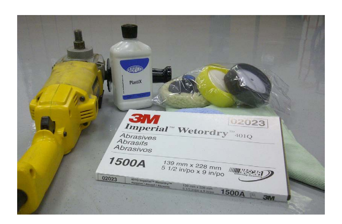
Pic A: Supplies Needed